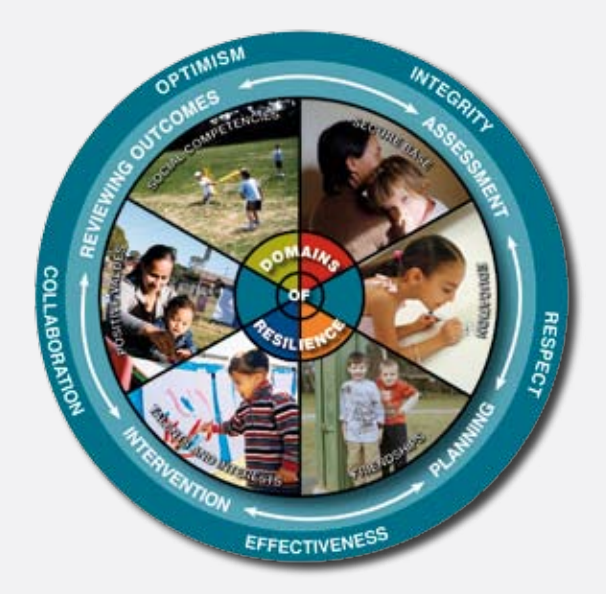
Figure 1: Domains of Resilience

The Benevolent Society uses the 'domains of resilience' model as a means for driving assessment & intervention. The model is used in combination with an ecological framework that demonstrates the levels at which resilience factors can be located.